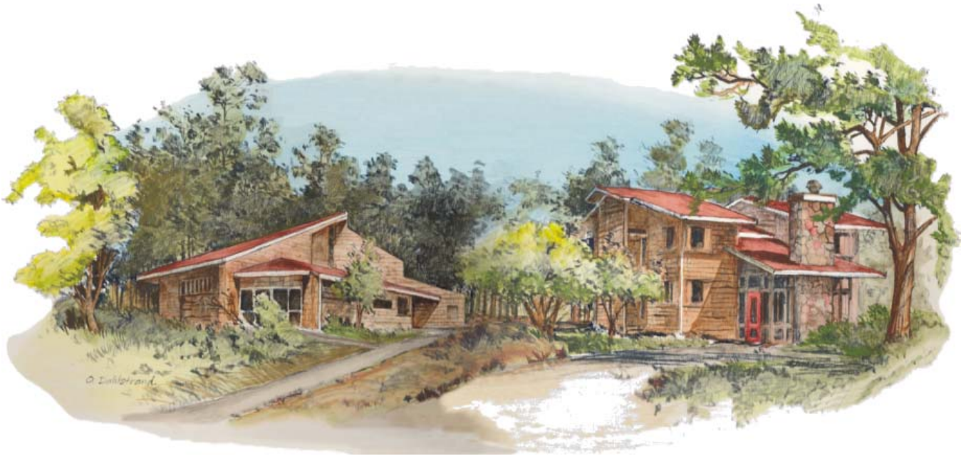
William Penn Mott Jr. Training Center