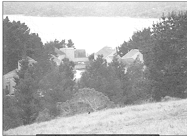
Marconi Conference Center's guestrooms overlook Tomaes Bay

We hope that between highly productive meetings you'll have some time to appreciate the rich human and natural history that surrounds us here. Please let us know if there is anything we can do to enhance your stay.